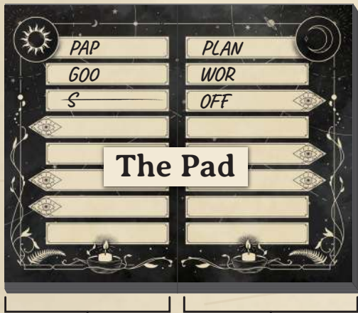
Sun team's side Moon team's side

Add more Mediums to each team. Mediums on a team share their hand of cards, work together, and can pass secret notes. Any of them can call “ Silencio .”