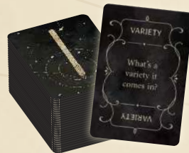
102 Question Cards