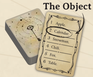
52 Object Cards