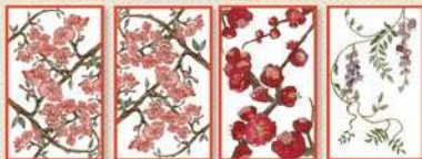
The community cards in the center of the table.