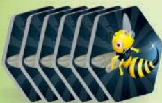
6 Wasp tokens