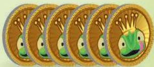
30 Yummy tokens