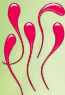
8 sticky tongues (including 2 spare tongues)