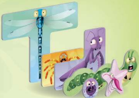
30 Insect tokens (6 x 5 different colors)