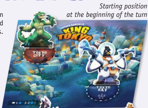
Starting position at the beginning of the turn

MekaDragon begins his turn in Tokyo and gains 2 ★ for that.