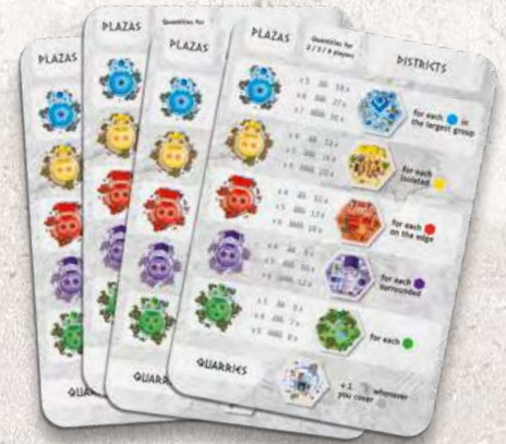
4 Player aids