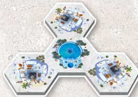
4 starting tiles