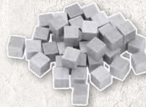
40 Stone cubes