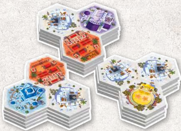
61 City tiles