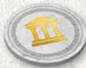
Chief Architect marker