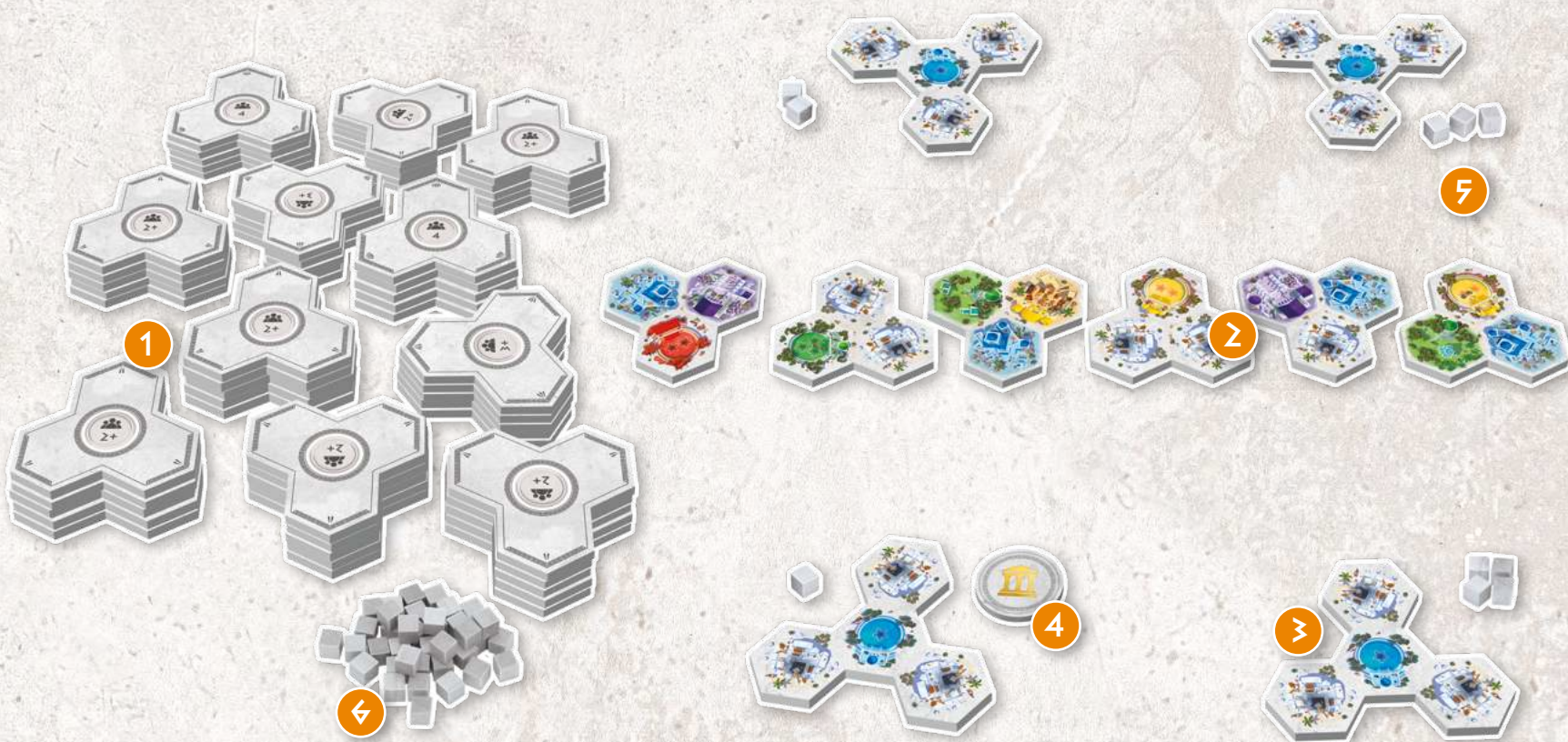
Example of setup for 4 players.

Tip: At the start of each round, there must always be 2 more tiles in the Construction Site than the number of Architects. Here, 6 tiles are laid out for 4 players.