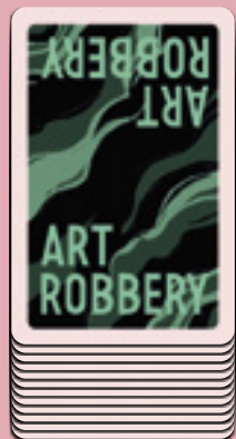
Face down draw pile