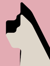
Guard Dog figure