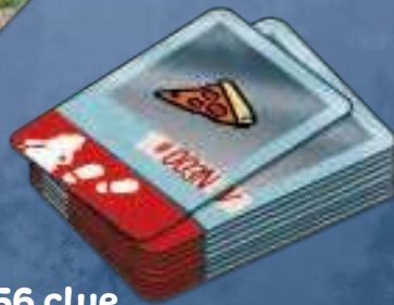
56 clue cards