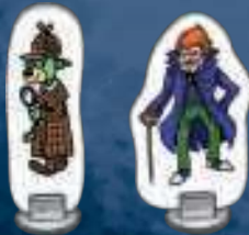
2 standees (Spy Guy & Doctor Moritz)