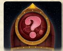
Unknown Destination Icon

Destination tokens are used by the Pilot's effect and by the player who places the first astronaut in a ship with an UNKNOWN destination. When either of these situations occur, the active player takes any destination token from the supply and places it on top of the ship's printed destination. This ship is now bound for the destination printed on the token.