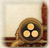
Third Production Phase