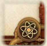
Reveal Discovery Phase

The first player flips all discovery cards in play faceup. Each discovery card effect resolves during the phase indicated by the icon in the lower-right corner of the card, as shown below.