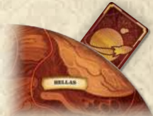
A discovery card assigned to Hellas.

Discoveries are scientific phenomena or geographical features that can be found on Mars. When a player draws a discovery card, he assigns it facedown to any outer zone of Mars by physically sliding a portion of the card under the board. At the end of the game, discovery cards provide either a positive or negative effect (e.g., that zone produces more point tokens).