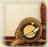
Final Scoring Phase

At the end of the reveal discovery phase, the first player advances the round tracker to the next notch.