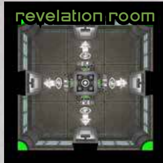
"So, what did you discover?"

Secretly look at 2 rooms adjacent to the REVELATION room.