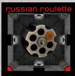
"One in six. I love this game!"

When the Roulette Room is revealed, place the 6 Roulette Tokens face down on top of it. Whenever a character enters this room, each character in the room (starting with the one who just entered), draws a Roulette token. A character who draws the 🟡 token is immediately eliminated. Roulette tokens are only shuffled and placed back on the Roulette Room when the 🟡 token is revealed.