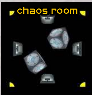
"It's time to make things a little more difficult. This game becomes too easy."

Swap 1 adjacent and non-blue room with a yellow or red room in the complex. Those two rooms must be empty. If there is no empty yellow or red room in the complex, this room has no effect.