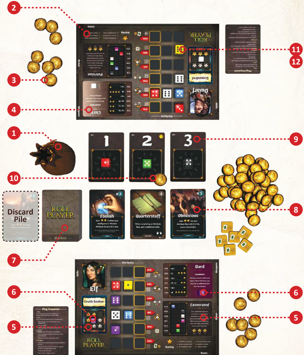
Two-Player Setup Example