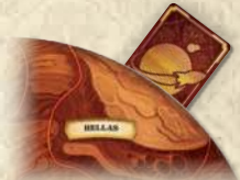
A discovery card assigned to Hellas.

Discoveries are scientific phenomena or geographical features that can be found on Mars. When a player draws a discovery card, he assigns it facedown to any outer zone of Mars by physically sliding a portion of the card under the board. At the end of the game, discovery cards provide either a positive or negative effect (e.g., that zone produces more point tokens).