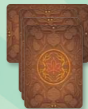
Score pile 10 points

You keep track of your points by taking cards from the discard pile and turning them face down. On the back, you can see point indicators at the top and bottom of the card. Indicating one or two points. You can make a row of these face down cards to keep track of your points. You cannot fall below zero points. In the exceptional case where there are no cards in the discard pile any more, you can turn face down cards in your point row a quarter turn (across the row) to indicate that this card counts as five points.