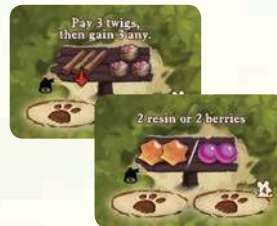
4 FOREST CARDS