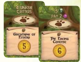
9 SPECIAL EVENT CARDS