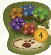
1 FLOWER FESTIVAL EVENT TILE