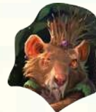
1 RUGWORT TOKEN