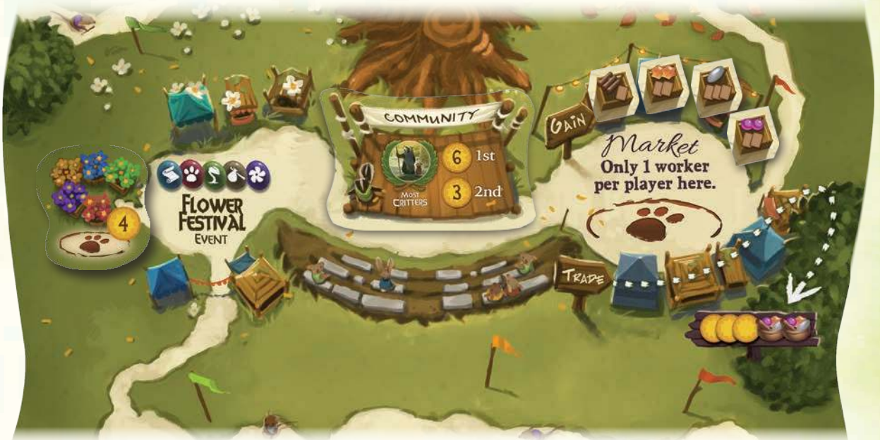
Bellfaire board set up to play with the Flower Festival, Garland Awards, and Market modules.

The Bellfaire board contains the Market location, and spaces for the Flower Festival Event and Garland Award tiles.