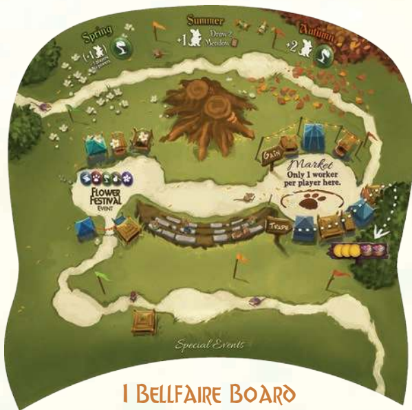
1 BELFAIRE BOARD