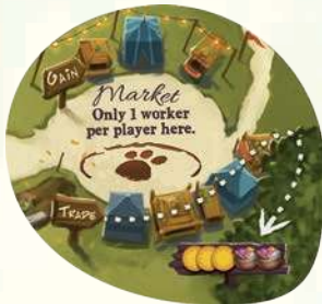
1 MARKET BOARD