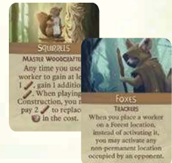
15 PLAYER POWER CARDS