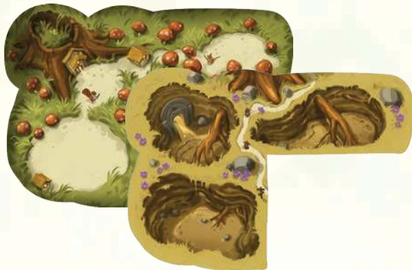
6 PLAYER BOARDS