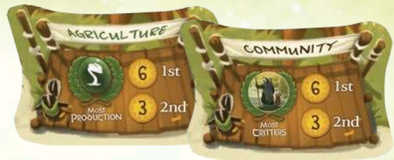
7 GARLAND AWARD TILES