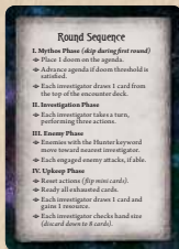
Player Reference Card