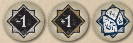
44 Chaos Tokens

Examples of the components in the game are presented here for identification purposes. A complete card anatomy can be found on pages 28–31 of the Rules Reference.