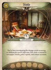
Location Card (double-sided)