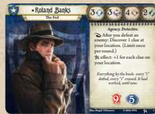
5 Investigator Cards