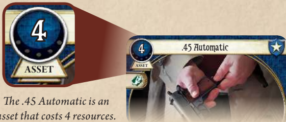
The .45 Automatic is an asset that costs 4 resources.

When an investigator uses this action, that investigator selects an asset or event card in his or her hand, pays its resource cost, and plays it. A card's resource cost and cardtype are found in its upper left corner.