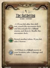
Scenario Reference Card