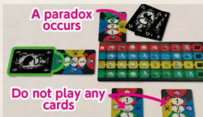
Figure 3-7 Occurrence of a paradox

Peter reveals his hand and declares that a paradox has occurred. The current trick is interrupted and players after Peter are not allowed to play any more cards. Players who have revealed their cards in this trick before Peter put aside the cards played in this trick. Leave the research board as it was when the paradox occurs.