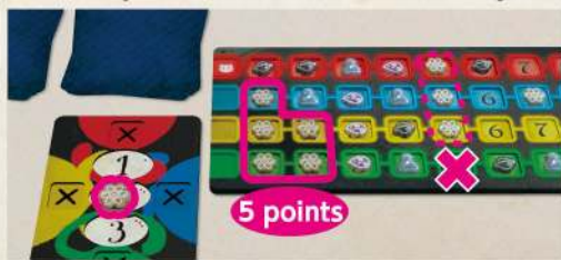
Figure 3-10 Score of the player who caused the paradox

Anne predicted she could win “2 tricks” during the victory prediction and she actually won 2 tricks. Anne checks the research board and found her largest adjacent group is made from 5 tokens, thus Anne scores 5 points as a bonus score.