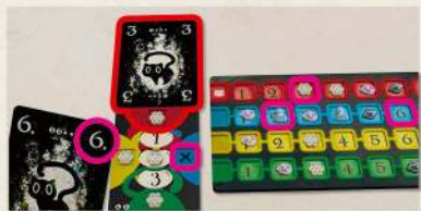
Figure 3-4 Declaring the observed color II

The start player declares "blue" as the led color. Anne can also declare a "blue" cat card, but she chooses to declare a "red" cat card, thus removing her player token from the "blue" X on her player board. Since her player token on the "blue" X is removed, she cannot declare "blue" for the remaining of this round.