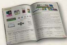
Figure 1-1 List of components

The components to be used differ according to the number of players. Refer to the table below.