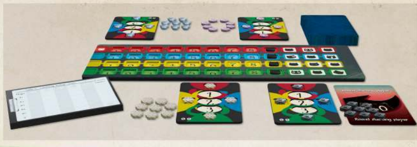
Figure 2-1 Preparation for 4-players