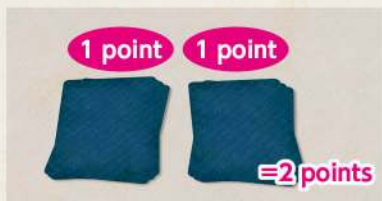
There are 2 piles of tricks in front of Anne. Therefore, Anne scores 2 points.

“Adjacent” refers to a state in which your player tokens are connected vertically or horizontally. Diagonal connection is not considered to be adjacent.