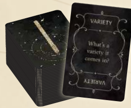
102 Question Cards