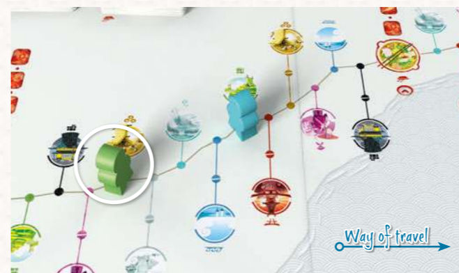
The Green traveler is farthest behind on the road, so he starts.

Sometimes the last Traveler may still be last after moving, in which case he goes again immediately.