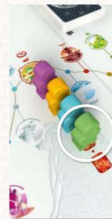
The green traveler will be the first one to leave the Inn.

The first traveler occupies the space nearest the road, and later travelers form a line after him.