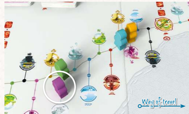
The Purple traveler is farther behind than the Green traveler, therefore he starts.