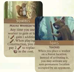
15 PLAYER POWER CARDS