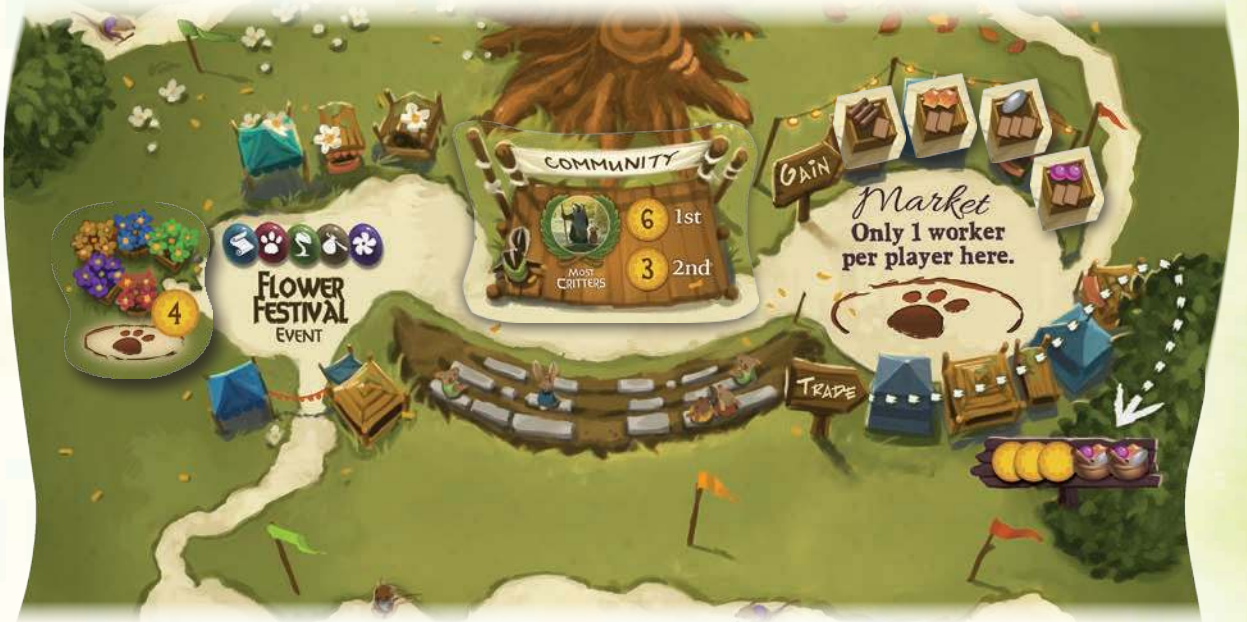
Bellfaire board set up to play with the Flower Festival, Garland Awards, and Market modules.

The Bellfaire board contains the Market location, and spaces for the Flower Festival Event and Garland Award tiles.