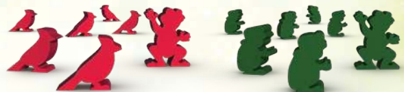
12 CRITTERS (6 CARDINALS, 6 TOADS) AND 2 FROG AMBASSADORS*