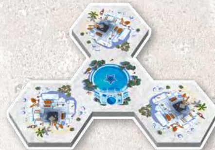
4 starting tiles