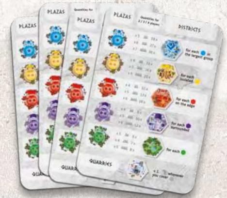
4 Player aids