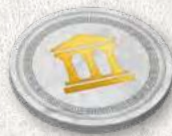
Chief Architect marker